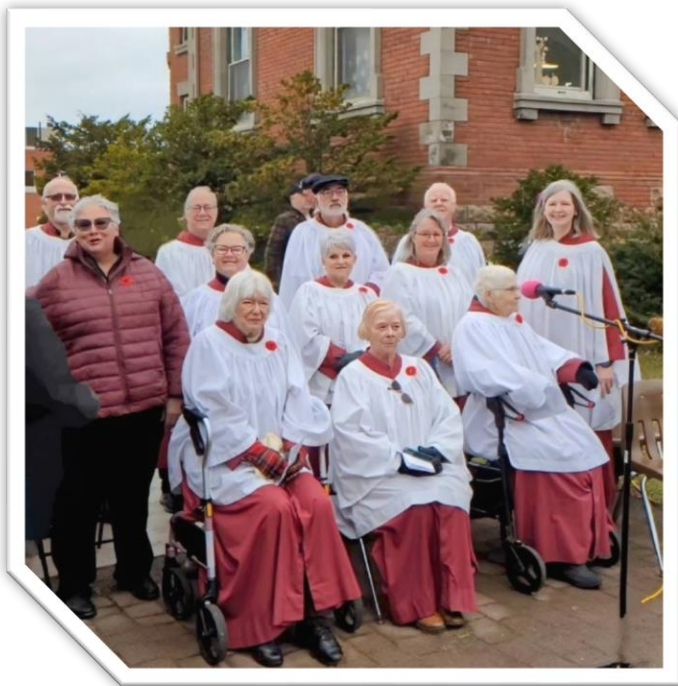
St. Paul's choir singing at the Remembrance Day Ceremony

Deadline for the Advent/Christmas issue of