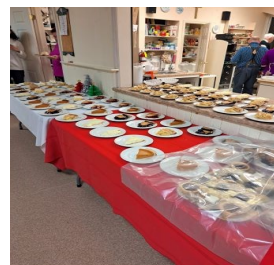
Some pictures from our Christmas Day dinner